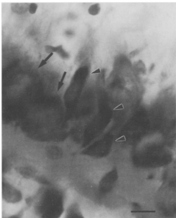
Fig. 3. Nissl-stained CA3c pyramidal cells in the brain of a CORT-treated animal. Note the presence of several small, darkly staining cells (arrowheads) adjacent to apparently healthy pyramidal neurons (long arrows). Scale bar = 25 \mu\text{m} .

CORT treatment resulted in significant differences in the total apical dendritic length present in a 100- \mu\text{m} -thick